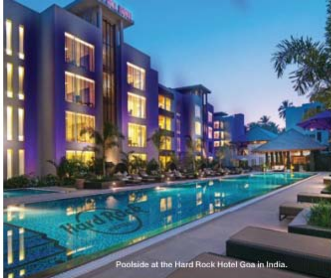
Poolside at the Hard Rock Hotel Goa in India.